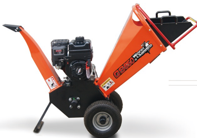
GS650 WOOD CHIPPER

Weifang Austter Industry & Trade Co.,Ltd. East Mountain Industrial Park, 262100 ShuangFeng Avenue, AnQiu Weifang City, China Tel: +86 155 0536 8258 E-mail: info@austter.com www.austter.com